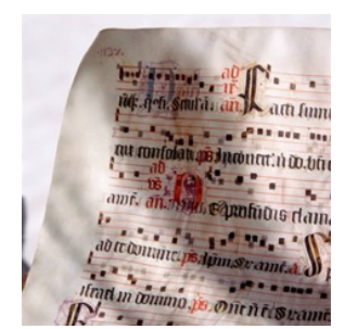
Sunday 17 December Joyful in the Story Nine Lessons and Carols