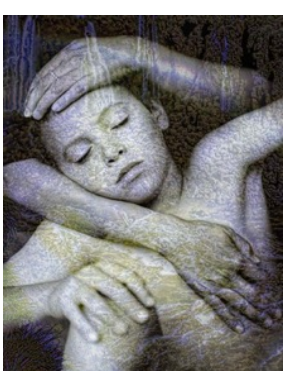
Sunday 10 December Comforted and Uncluttered Peace through clarity of vision