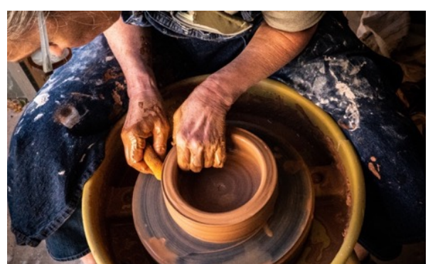
Sunday 3 December Useful and Beautiful Clay fashioned in the hands of God

Searching Israel's ancient wisdom for insights, we explore three aspects of the spiritual longing of those who waited for the coming of the Messiah, with the view of articulating our current hope for the world. On the third Sunday, we tell the Christmas story in our service of Nine Lessons and Carols.